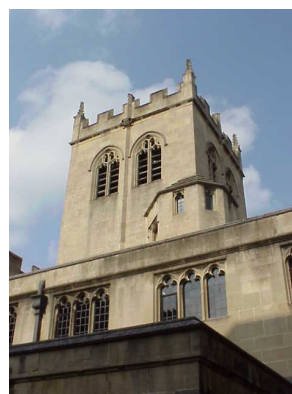
Church Tower Blackfriars, Oxford

In addition to the pastoral care provided by Blackfriars, Visiting Students have full access to the Counselling Services of the University.