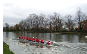
On the river

The tutorial system enables close monitoring of academic progress. The close-knit environment of an Oxford Hall is ideal for ensuring Student Welfare.