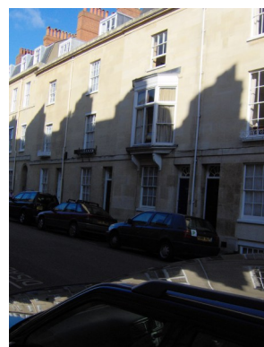
Student accommodation in St John Street, a stone's throw from Blackfriars

Each tutor writes a report on the student at the end of term and the student has a meeting with the Vice-Regent to discuss the term's work.