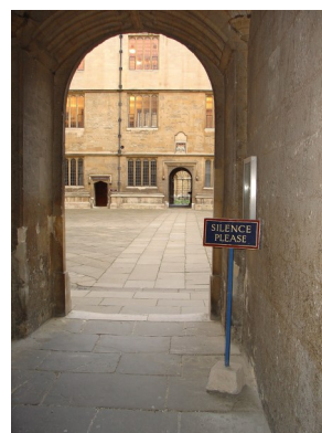
The Bodleian Library, University of Oxford

What to bring to Oxford? The Overseas Student Programme Liaison Manager is in contact with the students throughout the summer preceding their arrival, and will give details about what should be brought. Students may address any queries directly to the Liaison Manager.