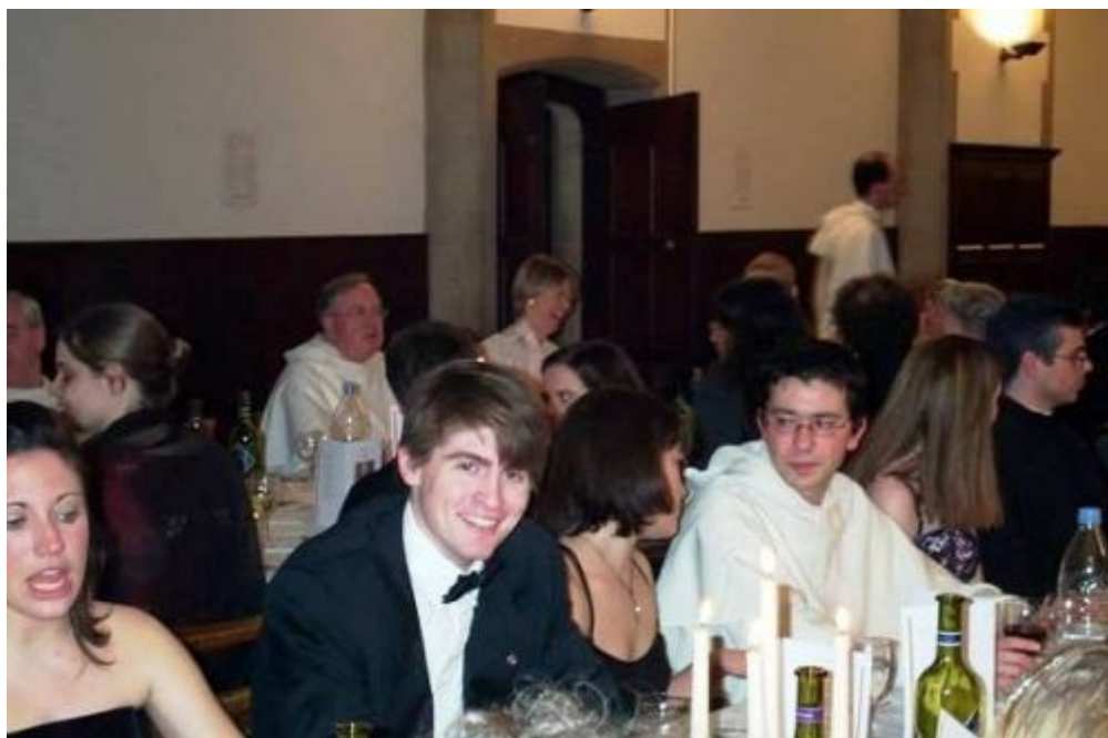
Annual Hall Dinner

The Dominican vocation is summed up in the Order's motto veritas ('truth'), and encompasses the pursuit of truth about human life and dignity. The friars invite others to join with them in this pursuit. If you desire "to make sense of it all", Blackfriars may be right for you.