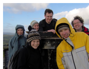
Blackfriars students enjoying a reading week in the Lake District after Michaelmas Term.

Our visiting students are accommodated in two comfortable and historic houses just outside the back gate of Blackfriars.